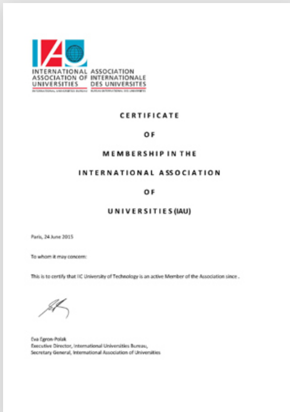
International Association of Universities